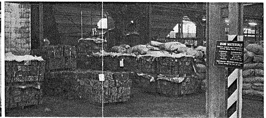
4. First stop — Raw Material Control.