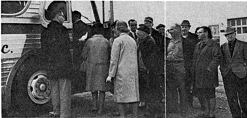
1. Boarding bus at athletic field for trip to plant.

News coverage of our series of Open House activities at the Bellefonte Works, beginning with the "private" Cerro employee-family open house held Friday, November 10th, followed by the public open house on Monday, November 13th, and concluded with the formal dedication of CERRO-BELLE by Governor Shafer on Wednesday, November 15th, has been well handled by local, state and national news media. Some stories in leading trade press publications are still to come.