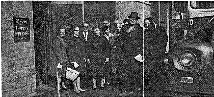
2. Welcome to Cerro!

Again, our sincere "THANKS" to all who helped plan and carry out these events and to those who attended.